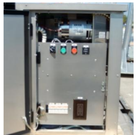
Disconnect switch motor operator