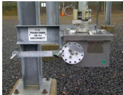
Disconnect switch manual mechanism