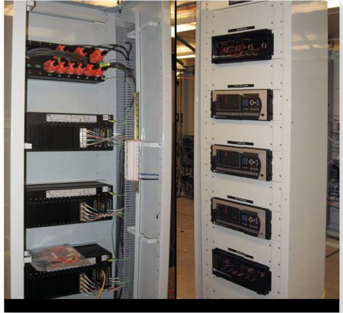
HardFiber protection panel with three relays and two patch panels (top and bottom). All I/O signals interface via fiber-optic communications.

The relays are GE Universal Relay series devices. The relay's current transformer/voltage transformer and contact I/O plug-in modules are replaced with an IEC61850 process card to allow optical rather than copper signal interface. The