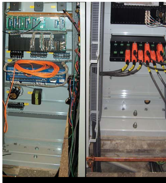
Before (left) and after (right) pictures show a significant reduction in the amount of cabling at relay panels.