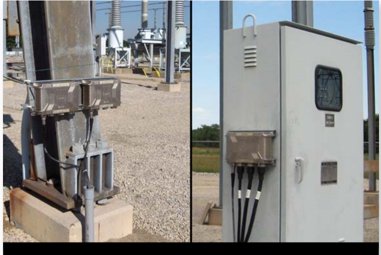
HardFiber bricks installed on a bus support structure (left) and a breaker marshaling box (right).

The HardFiber relays are connected to the Corridor Station local area network and thus to a station data-retrieval system, making the event records and oscillography of both the HardFiber and conventional relays available for remote access and analysis. The conventional and HardFiber relays are set up to cross-trigger oscillography through generic object-oriented substation event messaging over the local area network and force an oscillography record weekly in the absence of grid-generated events. Since the HardFiber systems for the Hyatt and Conesville lines were commissioned in June and December 2008, re-