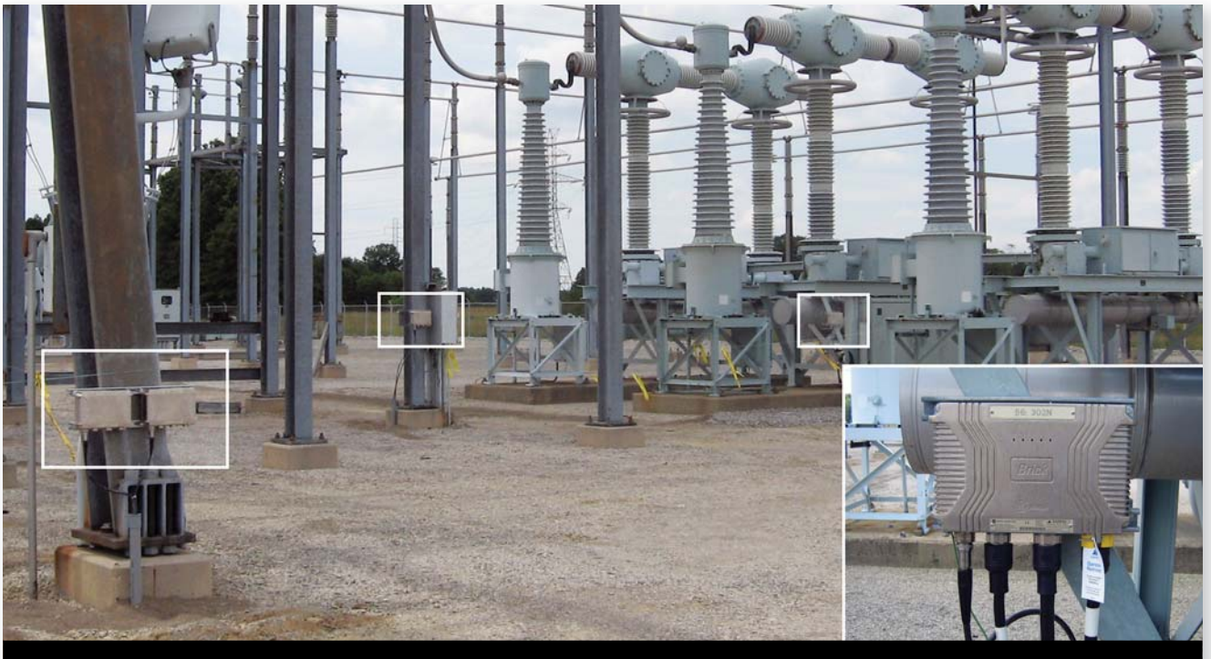
A demonstration installation at the AEP Corridor substation used the HardFiber process bus system, shown dispersed around the station, for communications interface.

For decades, AEP has been at the forefront of power system protection and control technologies. In the 1970s, the utility participated in the introduction of digital relaying. In the 1980s, it took part in early research into optical instrument transformers. In the 1990s, it was an early participant of the Utility Communication Architecture (UCA) group, subsequently the UCA Interna-