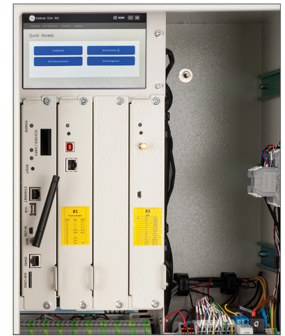
Location of maximum 3 x add-on cards

*** Time Response (typical): % of value after 1 measurement cycle.