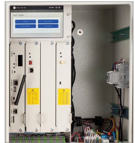
Location of maximum 3 x add-on cards

*** Time Response (typical): % of value after 1 measurement cycle.