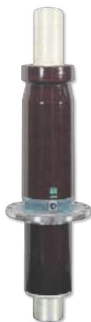
Fig. 3 24 kV - 25,000 A