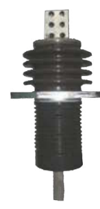
Fig. 7 20 kV - 10 kA