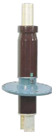
Fig. 4 24 kV - 25,000 A