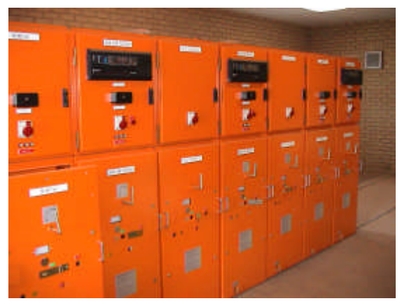
11kV F60 Feeder Protection to Pumphouse

substation facility for its water treatment operations. Daleside uses four UR F60 Feeder Management and two UR T60 Transformer Management relays to integrate high speed interlocking and protection functionality to facilitate automation and communications between the relays and Rand Water's PLC and SCADA systems over a redundant fibre optic communications network. Rand is also using six UR M60 Motor Management relays to ensure correct phase rotation and assist personnel in maintaining the motors at the site.